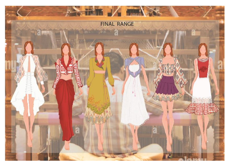
Fig. 3: Final range

There are six high-end dresses designed based on the traditional heritage of Tangail handloom. Basically the color, motif, fabrication are the key factor of this following series. The silhouette has taken from the trend report analysis and accessories are made of heritage materials. Western cutline of dresses gives a fusion look to the entire range. Figure 3 depicts the possible outcome of this study.