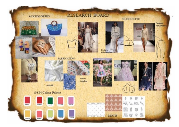
Fig. 2: Research board of design elements